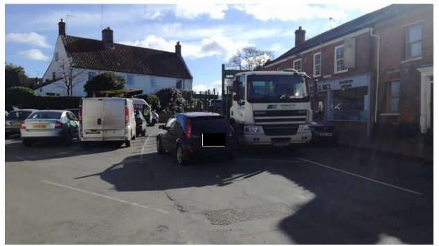
2 SECOND HGV PASSES PARKED CARS AND SQUEEZES PAST THE WAITING CAR

1 THE CAR FACING THE MANOEUVRING LORRY WAITS AS THE LORRY TURNS.